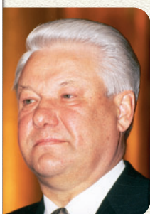
Boris Yeltsin 1931–

He advanced quickly in the party. When he became general secretary in 1985, he was the youngest Politburo member and a man who wanted to bring change. He succeeded. Although he pursued reform to save the Soviet Union, ultimately he triggered its breakup.